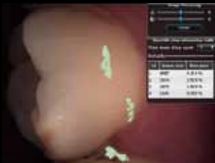
Numerical values correlate to possible caries degree.