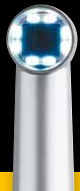
Auto-adjustable 8-LED illumination system.

Capture still images or videos with the CS 1500 camera and quickly display them on your PC or video monitor. Choose the wireless version for complete freedom of movement, or connect the camera to your computer directly via USB. The wireless CS 1500 camera supports AV and S-Video connections, eliminating the need for computers in every operator. Whichever option you prefer, the CS 1500 camera is easy to share throughout your practice.