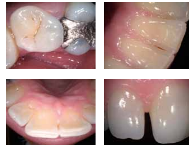
High quality images capture cracks, caries and other anomalies.

As a high-quality entry point into digital imaging, the CS 1200 combines both quality and affordability to create one exceptional camera that fits easily into any practice's budget.