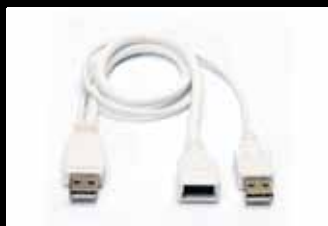
Variety of cables