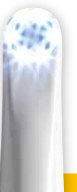
6-LED illumination system auto-adjusts to any practice lighting condition

Capture your patients' images and then review them directly from the camera. With its ability to store up to 300 images within the camera, the CS 1200 completely eliminates the need for memory cards or computers in each operator. What's more, the camera supports both PC and analog displays and a variety of connections (USB, S-Video, and AV) to make sharing more flexible and convenient than ever.