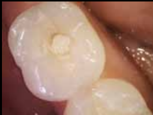
High quality images capture details invisible to the naked eye.

Plus, their compact and lightweight design ensures maximum comfort for users and patients alike. The result: stunningly clear, highly detailed images with each and every use.