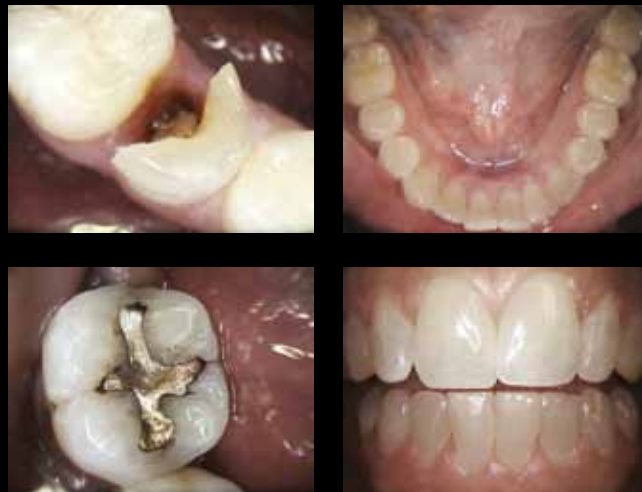
High quality images in a wide range of views.

From portraits to macro views, the camera delivers consistently clear, high-resolution images that can be easily shared with patients – so they see exactly what you see and are more likely to accept your treatment recommendations.