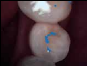
CS 1600 highlights areas of concern during screening.