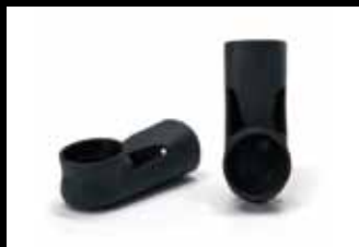
Collars for caries screening